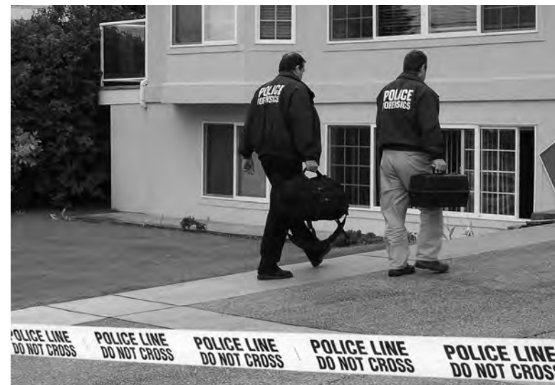
DPD Forensics attend a crime scene to collect evidence

T HE DELTA POLICE DEPARTMENT'S major crime section investigates crimes such as homicides, attempted murders, serious assaults, suspicious deaths, police shootings, missing persons, and other crimes of a complex nature, and it also manages witness protection. Delta police follow best practices when it comes to organizing investigations and managing evidence and information (including electronic files). This is intended to hold investigators accountable for their decision making and to allow a systematic method of disclosing information to both Crown and Defence, and ultimately the public, through the court process. Going about investigations in a methodical, comprehensive, efficient, and organized manner that ensures nothing is overlooked follows the principles of major case management (MCM), an approach to solving crimes and