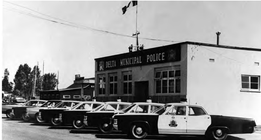
Delta Police station, 1960s.

Another major change in the early 1960s was the construction of a new police station. Prior to 1962, the police were housed in the basement of the municipal hall. (This historic building is now the Delta Museum.)