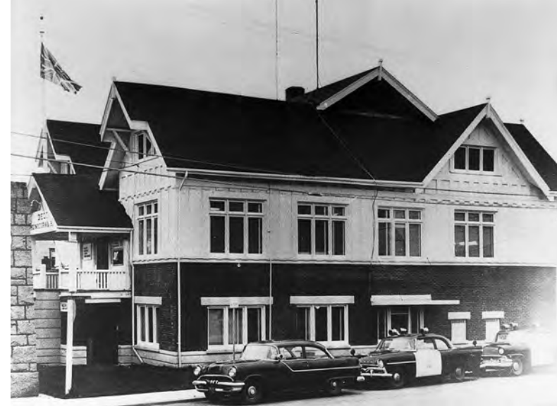
Municipal Hall, circa 1912.

I N 1912, THE MUNICIPAL HALL moved from its original location at Elliott Street and Chisholm Street and relocated to what is now the Delta Museum on Delta Street. The police office and jail were in the basement. The following eleven years saw eight men fill the position of chief constable, and little is known about them or their tenures except that one was dismissed for relieving the municipality of $106. During this time, the municipality suffered economic setbacks, as the salmon fishery on the river was beginning to wane. This development caused particular hardship among the cannery workers. Despite the local economy, the population of Delta continued to grow.