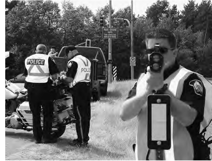
DPD traffic section working to keep Delta's roads safe

Investigations of all motor vehicle collisions in Delta involving a fatality and/or serious injury follow the same principles as a major crime investigation. (In fact, the major crime section enlists the help of the Collision Investigation Unit when it comes to mapping major crime scenes such as homicides.) Collision analysts are officers who have received extensive specialized training and who can examine vehicles for damage and interpret evidence found at the scene of collisions. Their expertise and training in subjects such as heavy commercial vehicles,