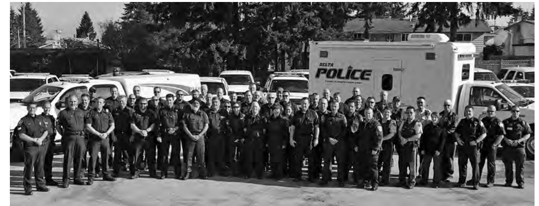
DPD Commercial Vehicle Inspection Unit coordinates joint forces operation, bringing over eighty officers to the streets of Delta